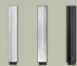
Solid aluminium Cylindrical legs Polished, Brushed or Black powder-coated