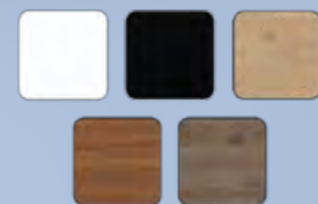
Laminate Base platform or Table top White, Black, Oak, Walnut or Dark Oak