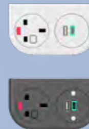
OE electrics Phase TUF