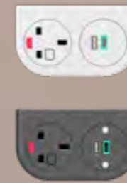
OE electrics Phase TUF