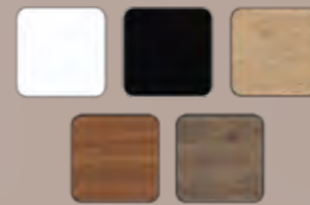
Laminate Base platform or Table top White, Black, Oak, Walnut or Dark Oak