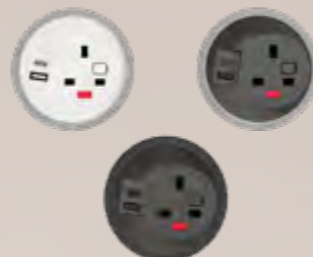
OE electrics Pixel TUF