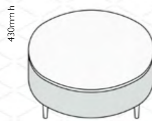
1000mm dia Doug circular table DUG TBL-C