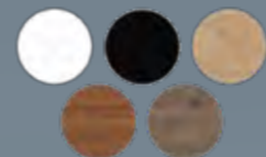
Laminate Table tops White, Black, Oak, Walnut or Dark oak