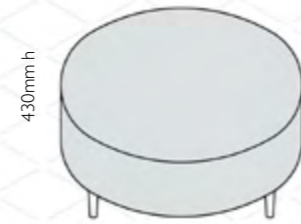
1000mm dia Doug circular otto DUG- CO