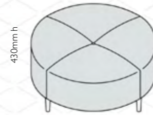
1000mm dia Doug circular otto with button detail DUG- CO/B