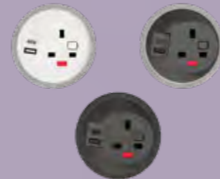
OE electrics Pixel TUF