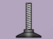
Height adjustable foot